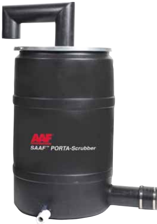
SAAF™ PORTA-Scrubber 200NP