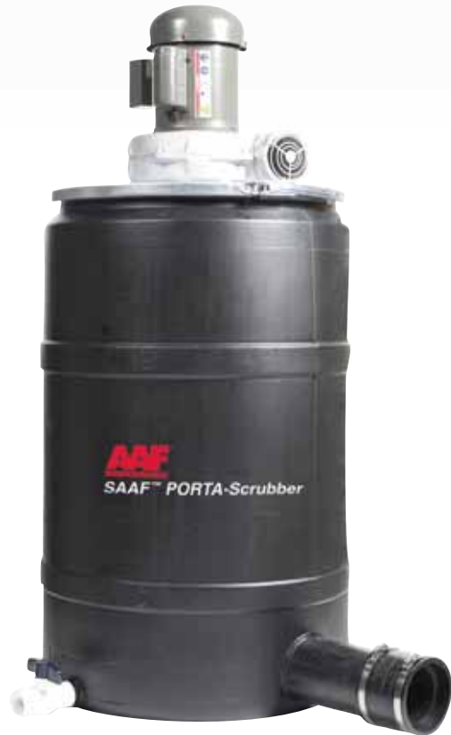
SAAF™ PORTA-Scrubber 200