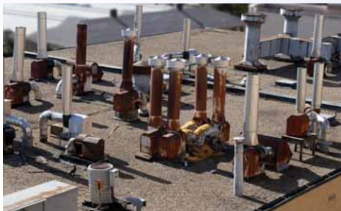
The SAAF™ PORTA-Scrubber can be used to capture fugitive emissions from laboratory vent hoods or chemical storage tanks.

The PORTA-Scrubber can be effectively used in a variety of fugitive emission applications, including sewage pumping station odor control or headworks, laboratory vent hood scrubbing, and at breather exhausts of chemical storage tanks. The PORTA-Scrubber is designed to induce a positive or negative pressure, depending on the application, on any enclosed space or vent.