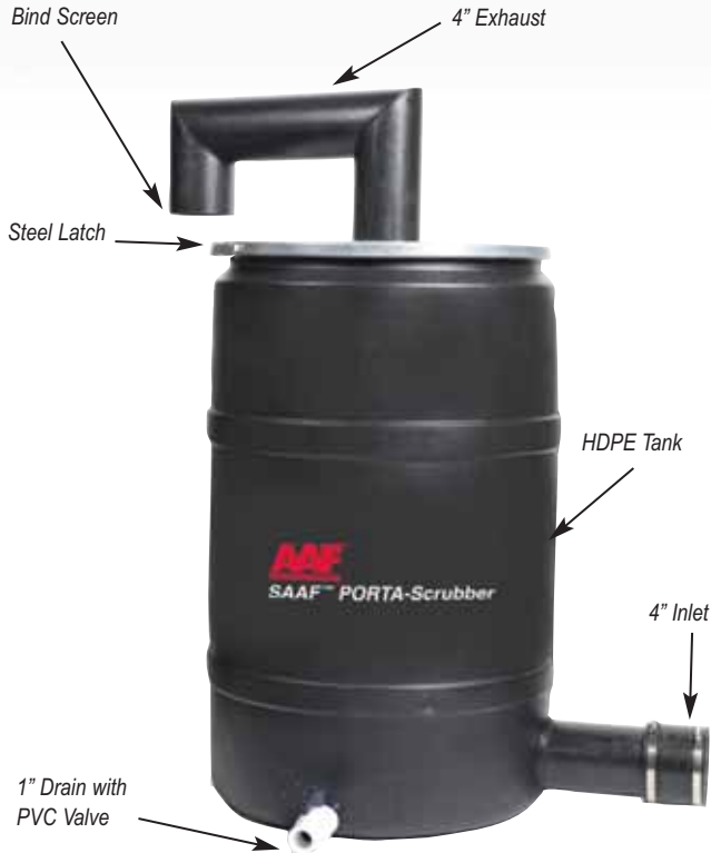
Typical Non-Powered PORTA-Scrubber