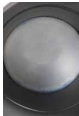
Step 3: Place the perforated screen on the PolyKlean Blue pad.