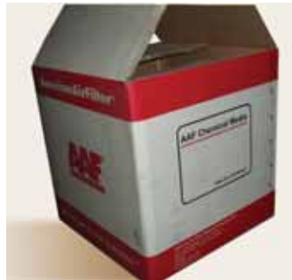
Figure 1.3.2.1: Typical carton box 12" high x 12" wide x 12" deep

1.3.2 Gas Phase Chemical Media: Gas phase chemical media is shipped in plastic bags within cardboard cartons or sling bags. The carton shown below has dimensions of 12" high x 12" wide x 12" deep and contains one cubic foot of SAAF chemical media. The weight of cartons will vary between 30 and 50 pounds, depending on the chemical media required.