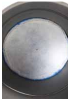
Step 2: Place the PolyKlean Blue pad on the HDPE grating.