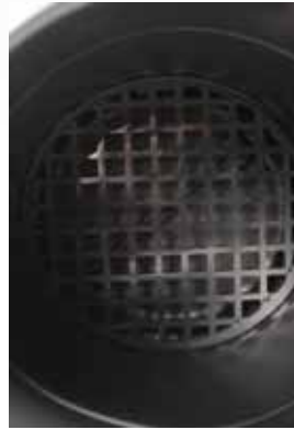
Step 1: Start with the tank empty and the HDPE grating exposed.

Remove the polypropylene perforated screen from the bottom of the tank. Place the PolyKlean Blue pad directly onto the HDPE grating at the bottom of the vessel. Ensure there are no gaps between the filter pad and the side wall of the tank. Place the polypropylene perforated screen on the PolyKlean Blue pad.