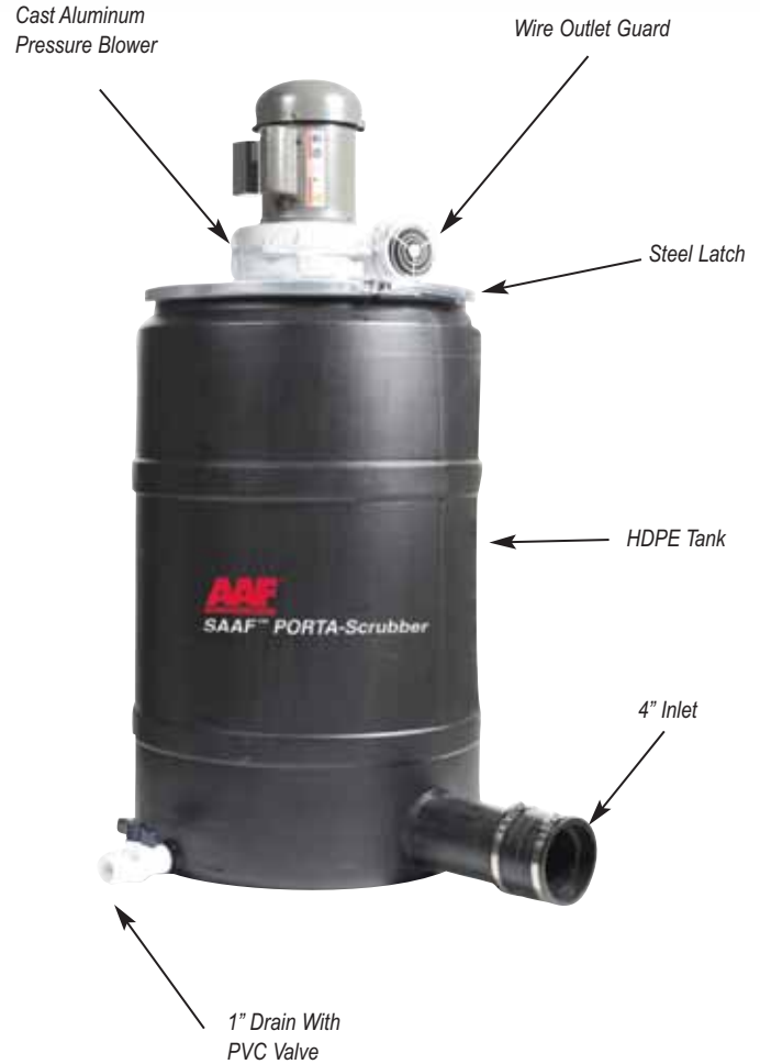
Typical Powered PORTA-Scrubber