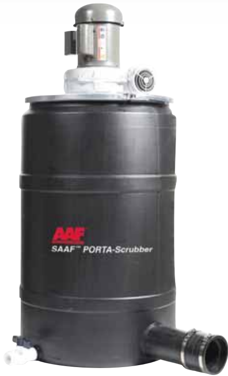
PORTA-Scrubber 200, with cast aluminum pressure blower.

1.3.2 Gas Phase Chemical Media: Gas phase chemical media is shipped in plastic bags within cardboard cartons or sling bags. The carton shown below has dimensions of 12" high x 12" wide x 12" deep and contains one cubic foot of SAAF chemical media. The weight of cartons will vary between 30 and 50 pounds, depending on the chemical media required.